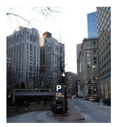
Pearl Street Entrance 55 Pearl Street Boston, MA 02110