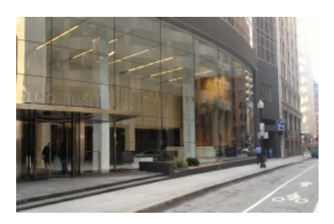
100 High Street Boston, MA 02110