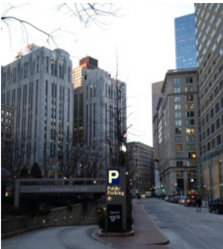
Pearl Street Entrance 55 Pearl Street